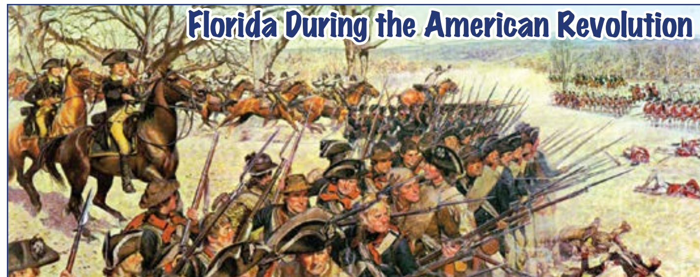
Depiction of the Continental Army circa 1776

By Jeanne Holmquist, Clearwater Historical Society Museum