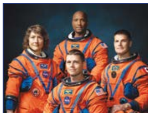
The crew of NASA's Artemis II mission (left to right): NASA astronaut Christina Hammock Koch, Reid Wiseman (seated), Victor Glover, and Canadian Space Agency astronaut Jeremy Hansen

The mission began with Orion entering Earth orbit, where Commander Reid Wiseman, Pilot Victor Glover, and Mission Specialists Christina Koch and Jeremy Hansen tested life-support systems, including the water dispenser, firefighting masks, and onboard toilet. On day two, Integrity set off on a free return trajectory, looping around the Moon and returning to Earth without major propulsion maneuvers other than course corrections.