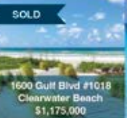
SOLD 1600 Gulf Blvd #1018 Clearwater Beach $1,175,000