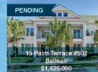
PENDING 15 Palm Terrace #502 Belleair $1,425,000