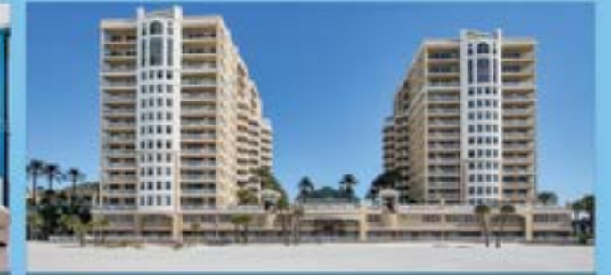
11 San Marco St. #408 | Clearwater Beach Experience Relaxed Coastal Living 2 Bed | 2 Bath | 1,840 SqFt | Offered at $1,395,000