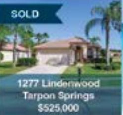
SOLD 1277 Lindenwood Tarpon Springs $525,000