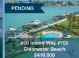
PENDING 660 Island Way #703 Clearwater Beach $410,000