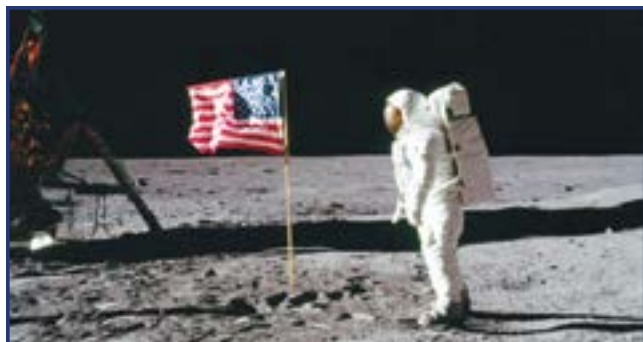
Astronaut Buzz Aldrin on the Moon, NASA