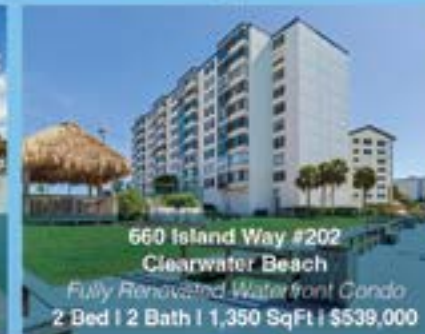
660 Island Way #202 Clearwater Beach Fully Renovated Waterfront Condo 2 Bed | 2 Bath | 1,350 SqFt | $538,000