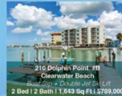
210 Dolphin Point #B Clearwater Beach Boat Slip + Double Jet Ski Lift 2 Bed | 2 Bath | 1,643 Sq Ft | $789,000