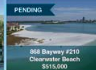
PENDING 868 Bayway #210 Clearwater Beach $515,000