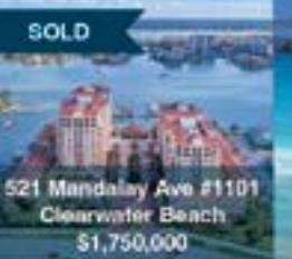
SOLD 521 Mandalay Ave #1101 Clearwater Beach $1,750,000

TARA BEHESHTI | YourWaterfrontRealtor.com