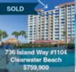
SOLD 736 Island Way #1104 Clearwater Beach $759,900