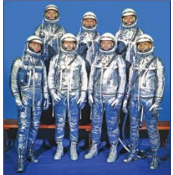
NASA's First Astronaut team, the Mercury "Original Seven." Front row, left to right, Walter M. Schirra, Jr., Donald K. Slayton, John H. Glenn, Jr., and M. Scott Carpenter; back row, Alan B. Shepard, Jr., Virgil I. "Gus" Grissom, and L. Gordon Cooper. (1962)

Project Mercury included 25 flights between 1958 and 1963, six of which carried astronauts. Its main objectives were to orbit a human spacecraft around Earth, study human performance in space, and safely recover both astronaut and spacecraft. More than two million people from government agencies and aerospace industries contributed their expertise to make the project possible. Mercury proved that humans could function in space for periods of up to 34 hours in weightlessness.