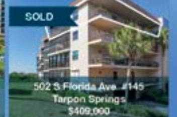
SOLD 502 S Florida Ave. #145 Tarpon Springs $409,000