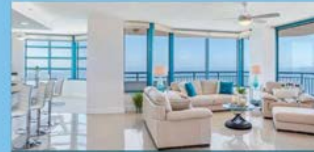
1520 Gulf Blvd #1602 | Clearwater Beach Direct Beach-Front Oasis 3 Bed | 2 1/2 Bath | 1,942 SqFt | $1,795,000