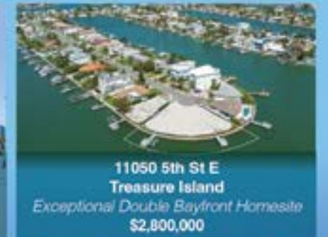
11050 5th St E Treasure Island Exceptional Double Bayfront Homesite $2,800,000