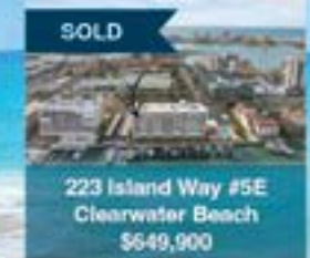
SOLD 223 Island Way #5E Clearwater Beach $649,900