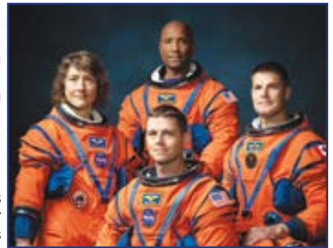
The crew of NASA's Artemis II mission (left to right): NASA astronaut Christina Hammock Koch, Reid Wiseman (seated), Victor Glover, and Canadian Space Agency astronaut Jeremy Hansen

The mission began with Orion entering Earth orbit, where Commander Reid Wiseman, Pilot Victor Glover, and Mission Specialists Christina Koch and Jeremy Hansen tested life-support systems, including the water dispenser, firefighting masks, and onboard toilet. On day two, Integrity set off on a free return trajectory, looping around the Moon and returning to Earth without major propulsion maneuvers other than course corrections.