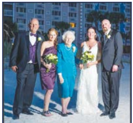
Four Generations of This Magazine's Family

To which the next generation rolls their eyes-and then goes and changes the world anyway.