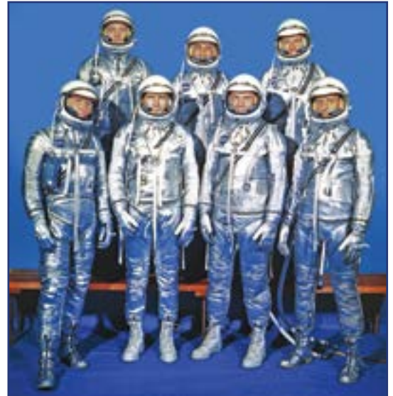
NASA's First Astronaut team, the Mercury "Original Seven." Front row, left to right, Walter M. Schirra, Jr., Donald K. Slayton, John H. Glenn, Jr., and M. Scott Carpenter; back row, Alan B. Shepard, Jr., Virgil I. "Gus" Grissom, and L. Gordon Cooper. (1962)

Project Mercury included 25 flights between 1958 and 1963, six of which carried astronauts. Its main objectives were to orbit a human spacecraft around Earth, study human performance in space, and safely recover both astronaut and spacecraft. More than two million people from government agencies and aerospace industries contributed their expertise to make the project possible. Mercury proved that humans could function in space for periods of up to 34 hours in weightlessness.