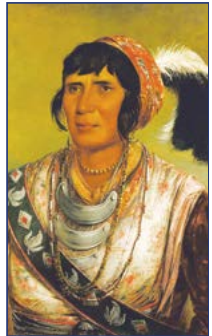
Osceola, Seminole warrior

Pressure for complete Indian removal continued. Congress passed the Indian Removal Act of 1830, which sought to resolve what officials called the "Indian problem" by relocating tribes to Indian Territory in present-day Oklahoma. Though labeled "voluntary," an estimated 60,000 Southeastern Native Americans were displaced. Approximately 15,000 died along the way, a tragedy remembered as the Trail of Tears. In Central Florida, Seminoles were taken to Tampa or Fort Myers, placed on ships, and transported to New Orleans. Forced removals continued through 1850.