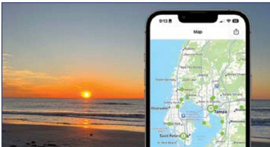
Pinellas County residents are installing sensors outside their homes to track pollution in real time via low-cost monitors (Local Haze app)

Air quality was once thought to be a “solved” problem with the adoption of the Clean Air Act in the 1970’s, but in recent years it is once again becoming an issue, as highlighted by wildfire smoke from as far away as the West Coast and Canada now regularly drifting over Florida. Air quality is not just regional; it is also highly localized, such as when air pollution from local sources is trapped in the overnight coastal fog. This pollution could be from New Year’s fireworks, open burning of yard waste, land clearing, or people simply enjoying an outdoor fire pit. Other sources, such as traffic pollution and industrial emissions, have more regional impacts, adding to the mix and further degrading the air that people in Pinellas County breathe.