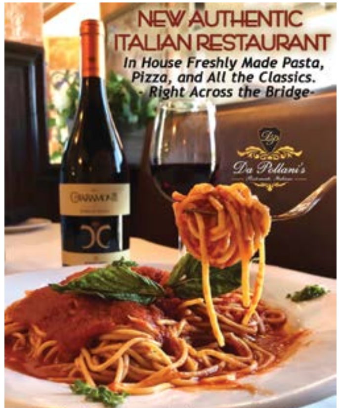
Da Pollani's Ristorante Italiano (727) 239-7855 13688 Walsingham Rd, Largo www.dapollanis.com

We continue our virtual worship and on November 8th at 9 am, we will start having services in our parking lot. Check our web page for further information. Be safe and stay in touch.