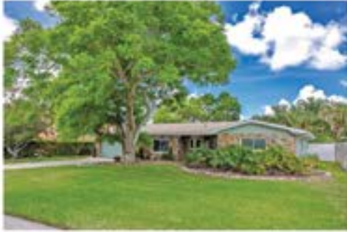
546 Lois Lane, Belleair Bluffs 3BR/2BA, Pool, 1718sf, Offered at $495,000

IT'S A SELLER'S MARKET & NOW IS THE TIME TO SELL