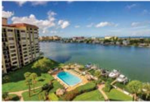
736 Island Way #804, Island Estates 2BR/2BA, 1980sf, Offered at $750,000