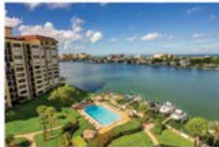
736 Island Way #804, Island Estates 2BR/2BA, 1980sf, Offered at $750,000