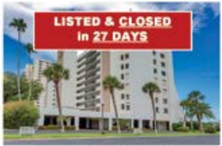
1250 Gulf Blvd. #606, Sand Key 2BR/2BA, 1265sf, SOLD for $532,500