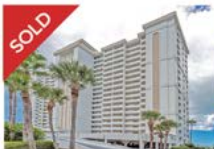
1230 Gulf Blvd. #1708, Sand Key 2BR/2BA, 1111sf, SOLD for $440,000