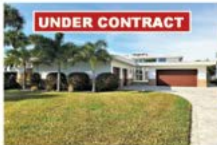
120 Gulf Boulevard, Belleair Shores 5BR/4BA, 4293sf, Offered at $3,999,000