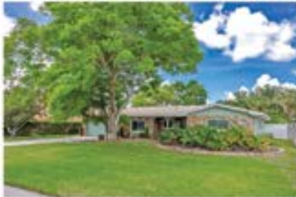
546 Lois Lane, Belleair Bluffs 3BR/2BA, Pool, 1718sf, Offered at $495,000

IT'S A SELLER'S MARKET & NOW IS THE TIME TO SELL