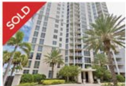
331 Cleveland St #2006, Clearwater 2BR/2BA, 1676sf, SOLD for $600,000