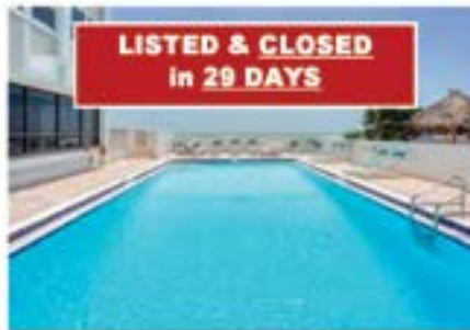
17408 Gulf Blvd. #902, Redington Shores 2BR/2BA, 1450f, SOLD for $583,000