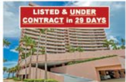
1310 Gulf Blvd. #8C, Sand Key 1BR/2BA, 1020f, Offered at $500,000