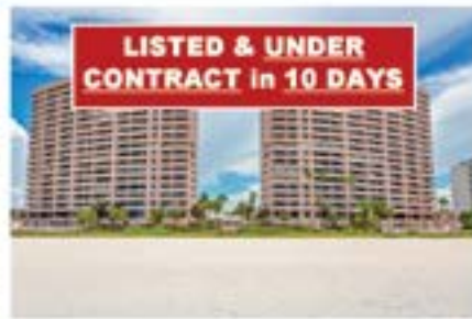
1340 Gulf Blvd. #16F, Sand Key 2BR/2BA, 1295sf, Offered at $685,000