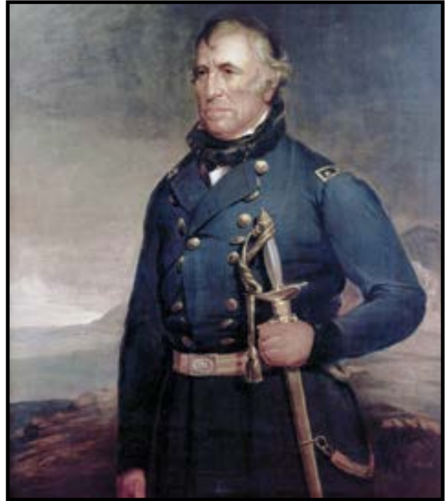
President Zachary Taylor's official presidential portrait by Joseph H. Bush

The party pulled together members of the old National Republican Party and disgruntled Democrats. Whigs also had links to the defunct Federalist Party – the country's first political party. - Continued on page 7